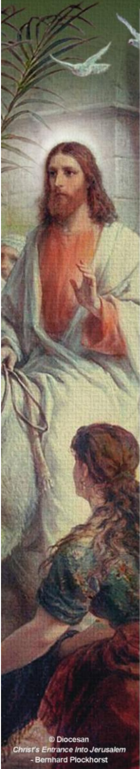
© Diocesan Christ's Entrance Into Jerusalem - Bernhard Plockhorst

4101 OLD BETHLEHEM PIKE, BETHLEHEM, PENNSYLVANIA, 18015 610-867-7424 - WWW.ASSUMPTIONBETHLEHEM.COM